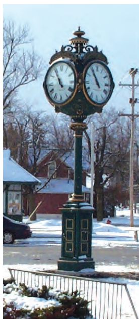
Rotary Club Coopersville, MI