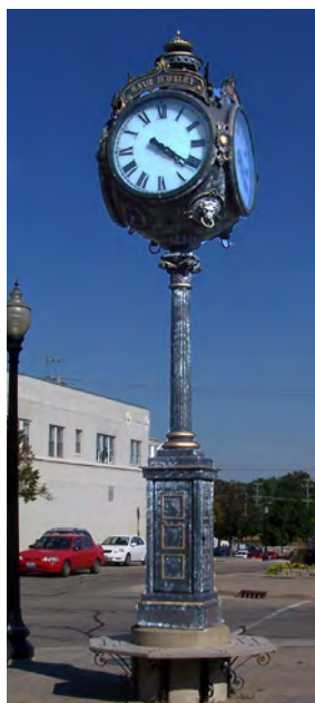
Crystal Lake, IL