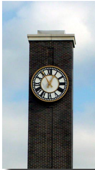
Conant High School Hoffman Estates, IL