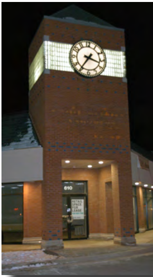
Naper West Plaza Naperville, IL