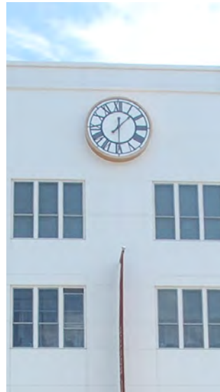
Franklin Hill Dorchester, MA