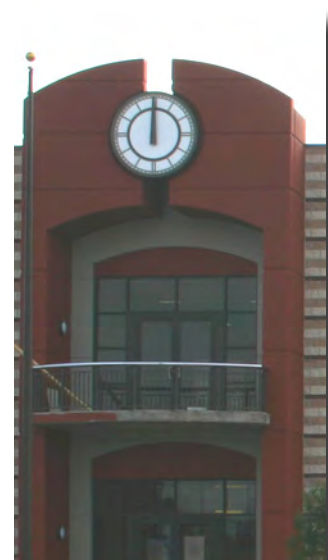
Lake Jackson Fire and EMS, TX