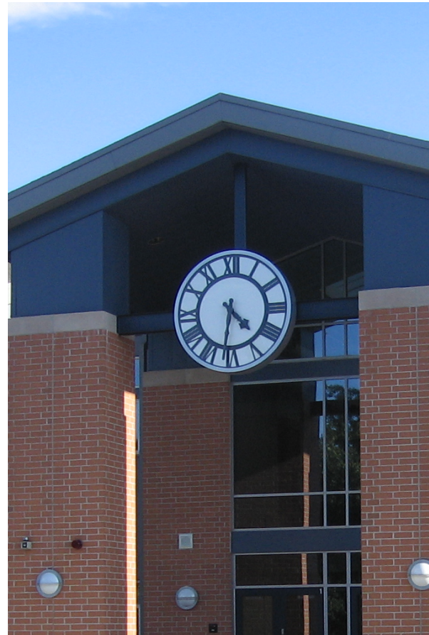
Ashland High School Ashland, MA