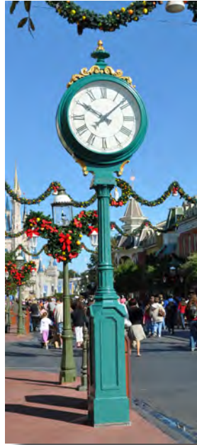
Orlando, FL - Main Street