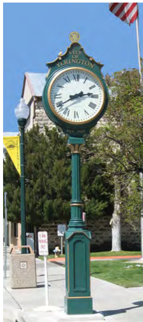
Yerington Rotary Yerington, NV