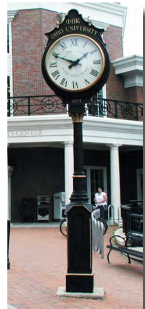
Ohio University - Athens, OH